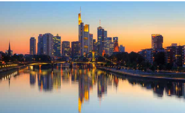
EXHIBIT / SPONSOR / ADVERTISE Prospectus

Reach compliance professionals from around the world